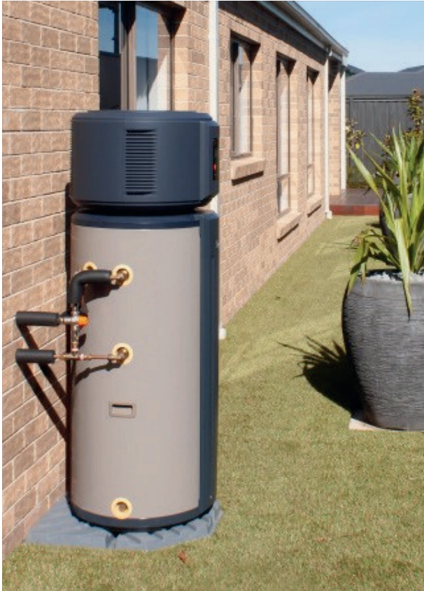
IHW170L Installed Unit

Additional warranties apply for customers, please refer to separate warranty details online www.ahi-carrier.co.nz